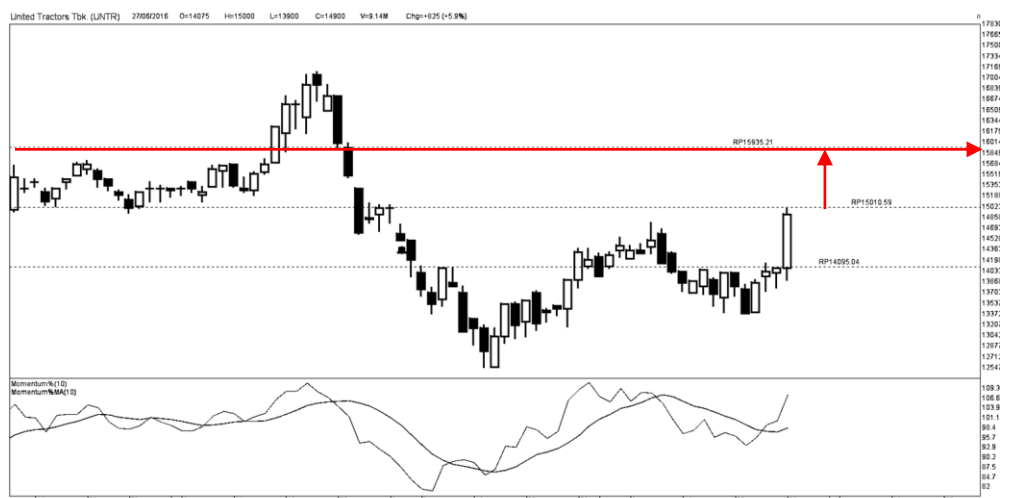
Kinerja harian saham UNTR