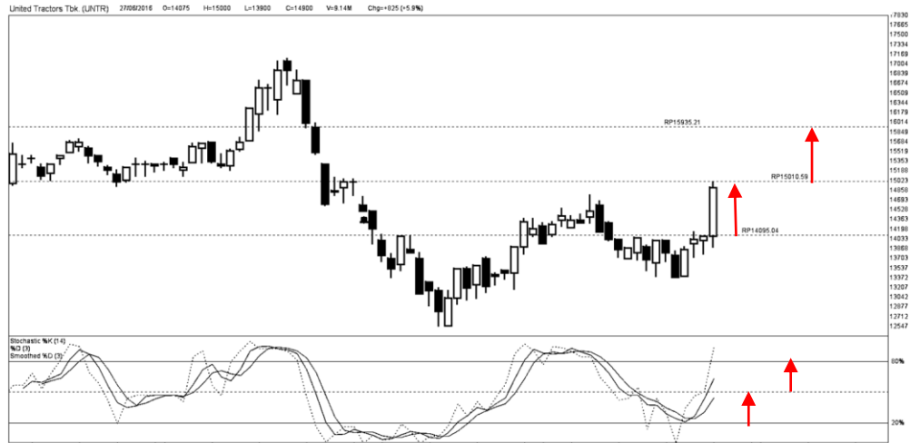
Kinerja harian saham UNTR

Danareksa research report are also available at Reuters Mulfex and First Call Direct and Bloomberg